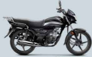
Black with Grey