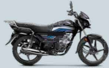
Black with Blue