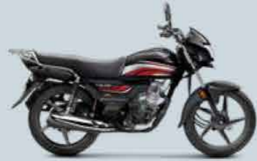
Black with Red